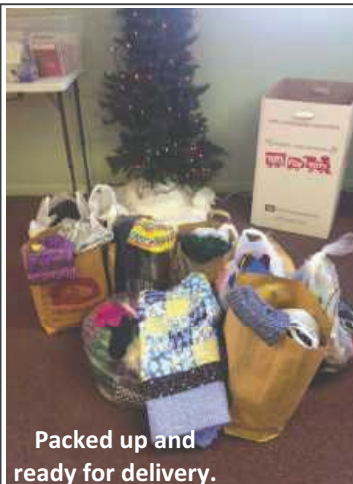
Packed up and ready for delivery.

Easy peasy! Take just 10 minutes to create a beautiful gift for the anytime of the year. Sign up today and make sure you stop by Loose and pick up a supply sheet. Please note: you will need to bring your sewing machine.